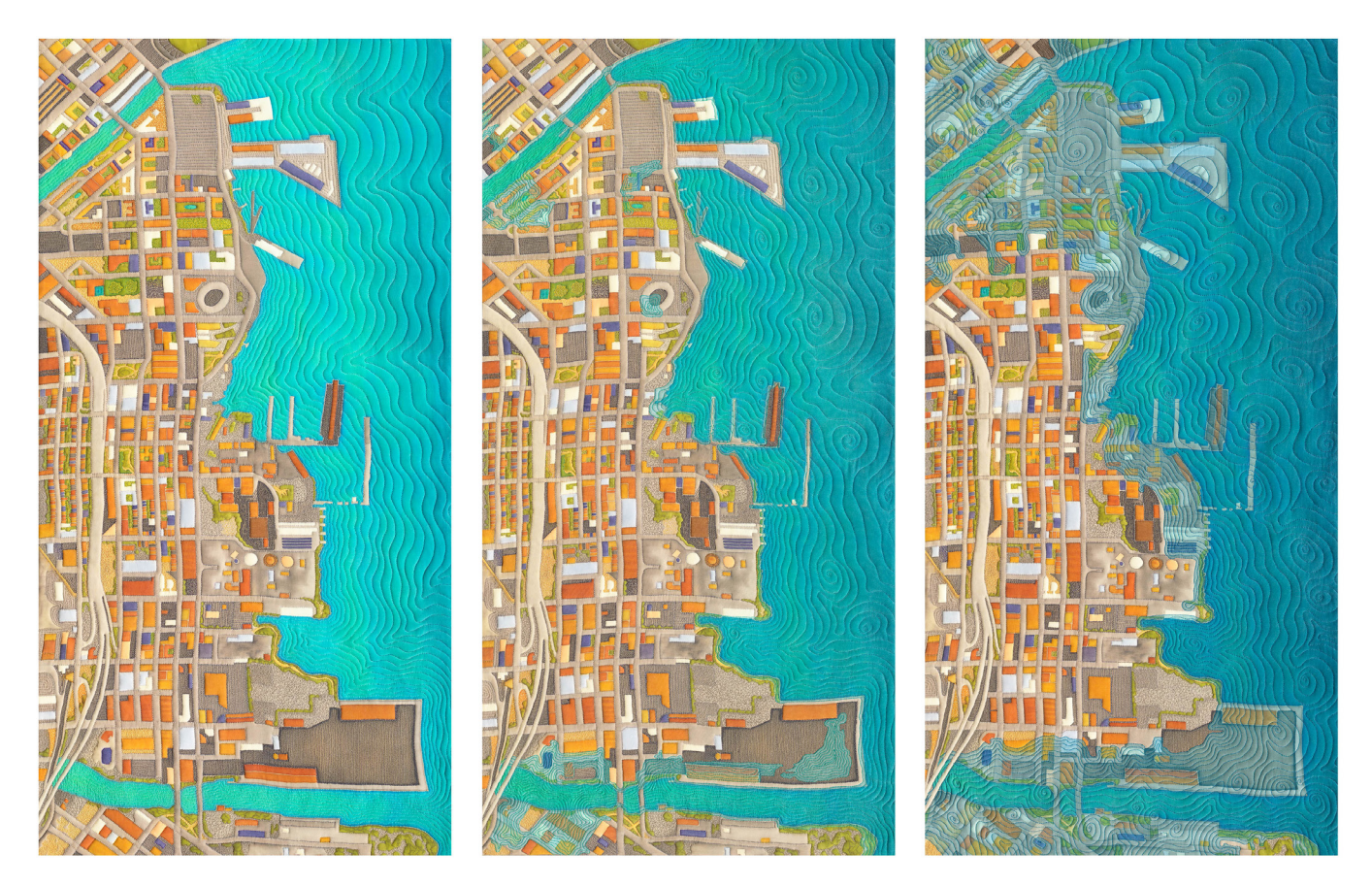
Linda Gass Dogpatch: the sea is rising: 0, 3 and 6 feet (triptych) 2019, digitally printed silk crepe de chine, recycled polyester batting, Lutradur, rayon/viscose, polyester embroidery thread, each 35.5" x 18" x 1.5".

Dogpatch, the sea is rising: 0, 3 and 6 feet, features the bay's shore that spans the neighborhood called Dogpatch, where MCD is located. The triptych reads from left to right, illustrating the progression of several city blocks of industrial buildings, grasslands, and marinas which will become submerged over time. One imagines a foreshadowing of the Bay Area becoming an Atlantis.