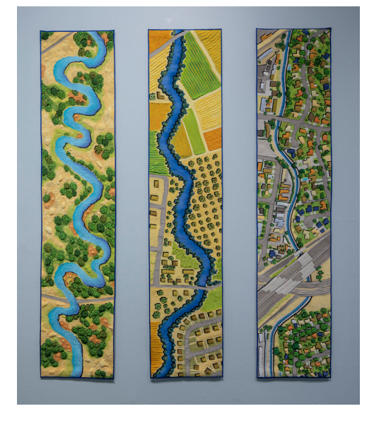
Linda Gass Urban Power vs. San Lorenzo Creek – What's next? (triptych) 2019, silk crepe de chine, silk broadcloth, silk Indian Doupioni, silk dyes, water soluble resist, polyester batting, rayon/viscose and polyester embroidery thread, each 59" x 12".

The piece is impactful in its quiet activism, emphasizing the tremendous loss of vital vegetation necessary to keep the ecosystem alive and sustain the water cycle. "The water cycle is chaotic and extreme," explains Gass. If no rejuvenation occurs, eventually the land will become a desert. This poses a particular threat to San Francisco and the surrounding cities who rely on the water from this river area.